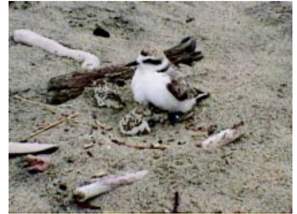
Adult and chicks

During the winter months, snowy plovers eat and rest, building up fat reserves. In the spring and summer, plovers nest in loose colonies, often coming back to the same beaches every year. The breeding season lasts from early spring to mid-fall,