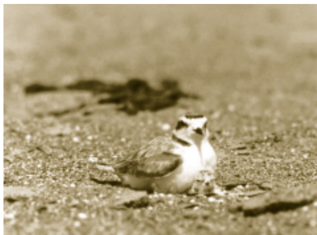
Adult on nest

With California State Parks' efforts and your active cooperation, we can make a difference in the survival of the western snowy plover on California beaches.