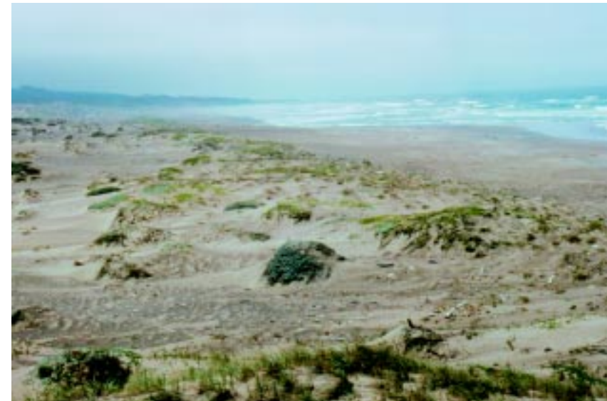
Plover habitat at Montaña de Oro State Park

Plovers can be found on flat, open coastal beaches in dunes, and near stream mouths. They are well-camouflaged and extremely hard to see, often crouching in small depressions taking shelter from the wind. California State Parks beaches provide much of the suitable habitat remaining in California for this small shorebird.