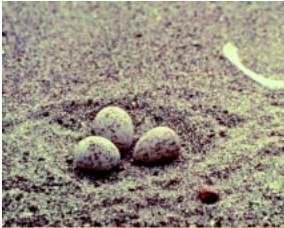
Plover eggs in nest